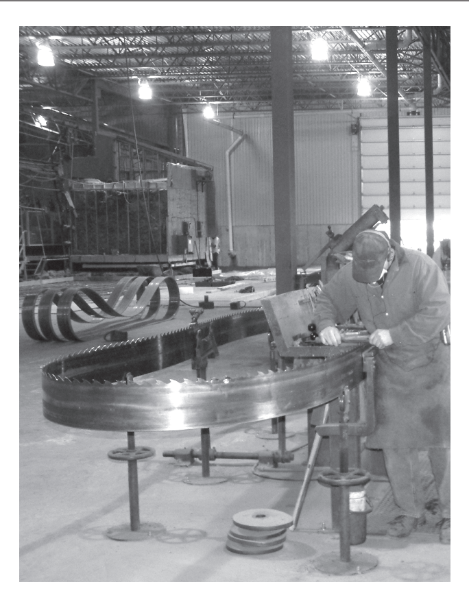
The trend towards band headrigs continues unabated.