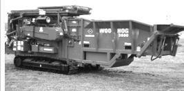
2011 "New Model" - Morbark 3800XL, 800-HP C27 Cat Engine

CHIPPERS 2005 Morbark Tornado 15, 140HP Cat, Winch, Auto Feed - Managers Special.....$29,549 2010 Morbark Beaver M12R, 110HP Cummins, Auto Feed, Your Choice of 2 - In Stock and Ready to Work - New and Unused - Only...$38,975 or BO