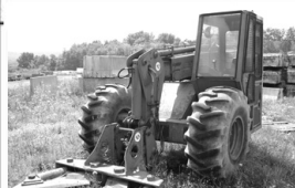
Morbark Mutt, Forestry Loader, Grapple, Stump Splitter. Runs Good Only: .....$22,500 or BO