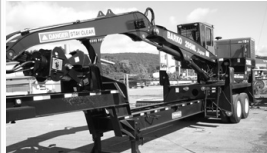
2010 Barko 295ML, Log Loader, Cummins 173HP, 30FT Knuckle Boom, Only:.....$141,452 or BO