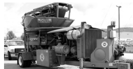
2006 Morbark 1000 Tub Grinder, Screens, Recent Rebuild, Financing Available: ..$110,000 or BO