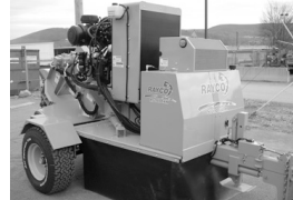
2011 Rayco RG140DXH, 140HP John Deere Diesel, Top of the Line Machine, NIS, List $56,000. Save Thousands

2010 Rayco RG-1635SJR, Self-Prop, 35hp Vanguard, Trailer, Lists for $18,330 - LCW No Trade Price: .....$17,000 2010 Rayco RG-1635T, Track, 35HP Vanguard, Trailer, Why Pay More for Diesel? Only: .....$19,995