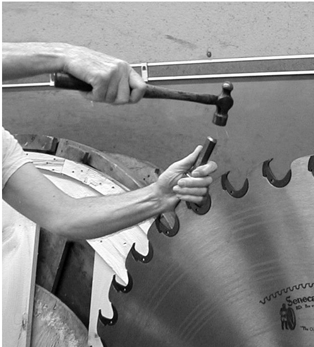
Using an upset swage.