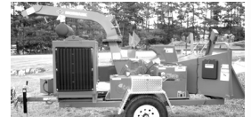
2010 Morbark Beaver M12R, Cummins 110HP, Price Increase Coming, buy now! .....$38,599