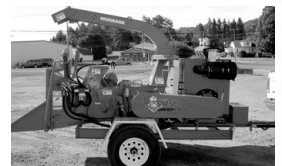
2010 Morbark Beaver M14R, Cummins 115HP, Diamond Plate Fenders, Clean out on Chute, Only: .....$39,995 or BO

Rotobec 5052 Grapple with RT252 Rotator .....$9,947 or BO Bobcat LR5A Landscape Rake .....$3,995 or BO FAE UNN/EX 125 Forestry Mulcher for Excavator (2 avail)$39,500 or BO ROCKLAND - Splitter for 200 Excavator .....$37,143 or BO 5052 Grapple W/RT 252 Rotator .....$9,696 or BO RAYCO Log Grapples, Several .....Make Offer