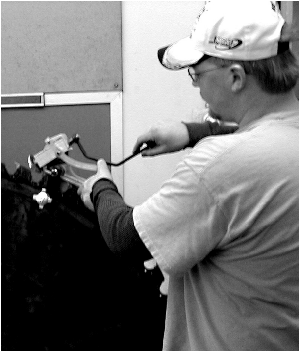
Troubleshooting most saw problems begins—and often ends—with sharpening.

and then after you dial one it says to check and fix the sharpening of the bits.