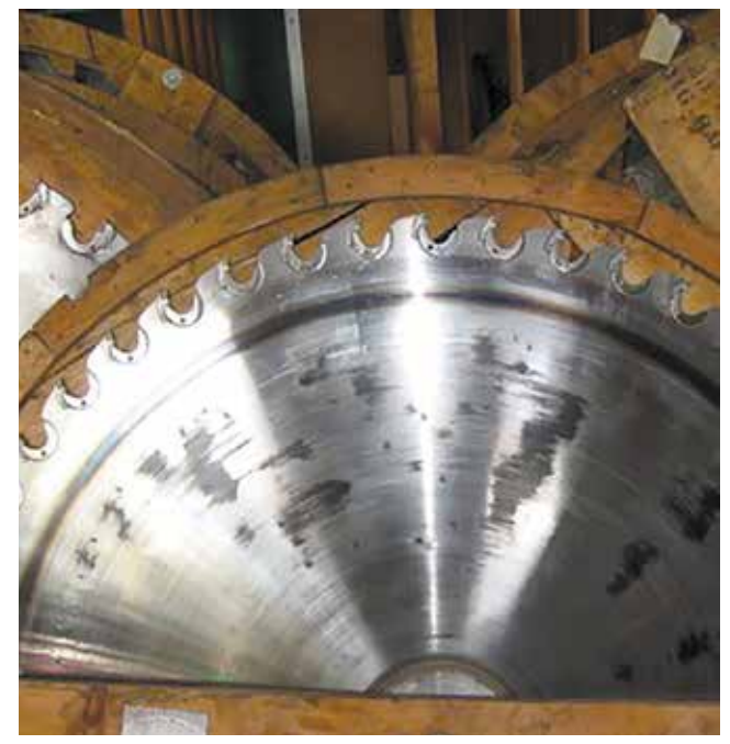
The guideline got very hot (blue) on this saw. The black patches are softwood pitch, showing the clear presence of high and low spots.

As to what caused that problem, there are lots of possibilities. When a saw is dished in either direction, something happened on the mill that caused it to dish, unless of course it wasn't hammered properly to begin with. Was it heat on one side?