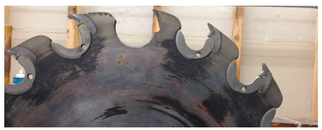
If just one socket is causing the problem, have a saw doctor replace it. More than one? Get a new edger saw.

On 56" headsaw, you can possibly weld as many as ten shoulders and still be repairing something that is worth more than the cost of the repairs. But by the time you have welded two shoulders on an edger saw, you are starting to get to that magic point where it just isn't all that economi-