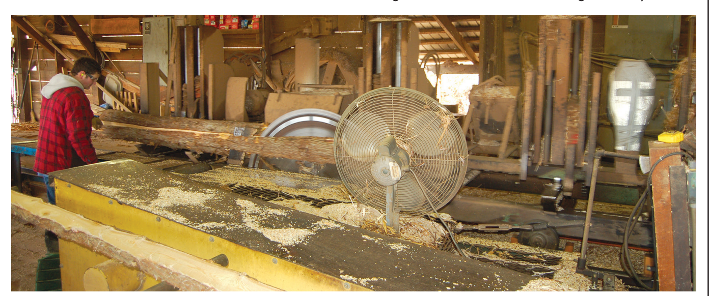
Saws need to run at the right speed for the material they're cutting—in this case, white cedar.

There is also a larger underlying problem here. A 56" saw running at 900 RPM is turning 13,188 SFPM. That's too fast, even for softwood. I find that the ideal speed for a production mill sawing primarily hardwoods is 8,000 to 9,000 SFPM, while softwoods will require a speed of 9,000 to 10,000 SFPM. Running 13,000 SFPM is as inefficient as driving your car in first gear on the interstate. You can imagine that anyone who