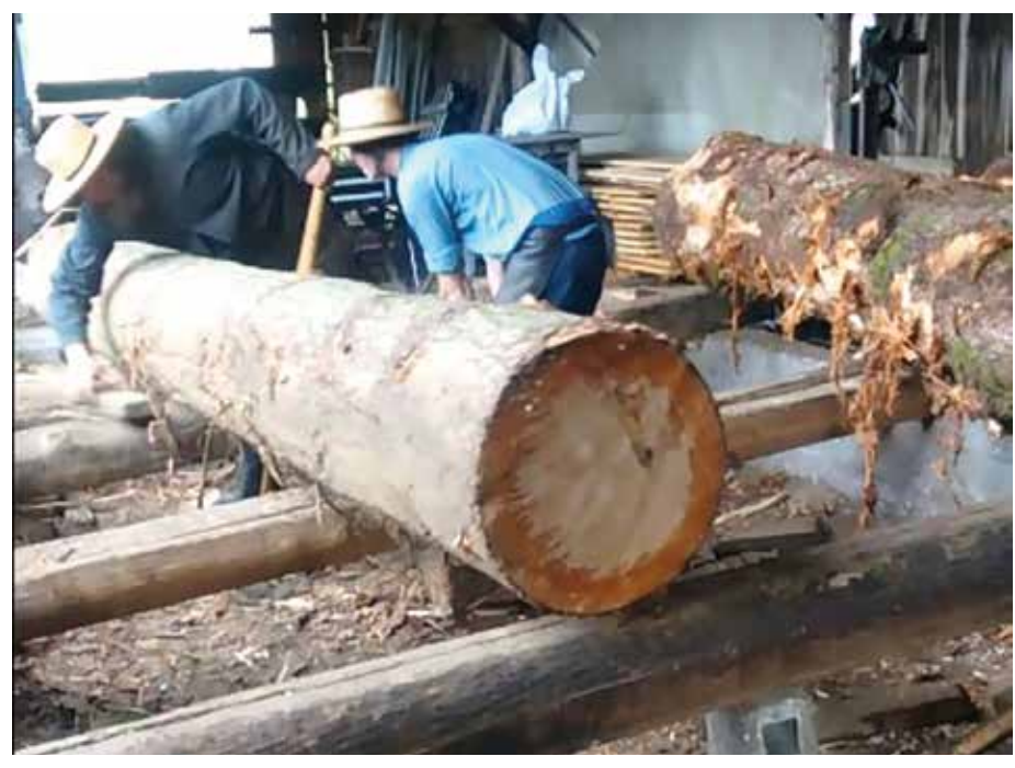
Just when you thought the hand-set/circular sawmill era was over.....

As these small portable band mills quickly increased in popularity, the market for the old hand-set circular