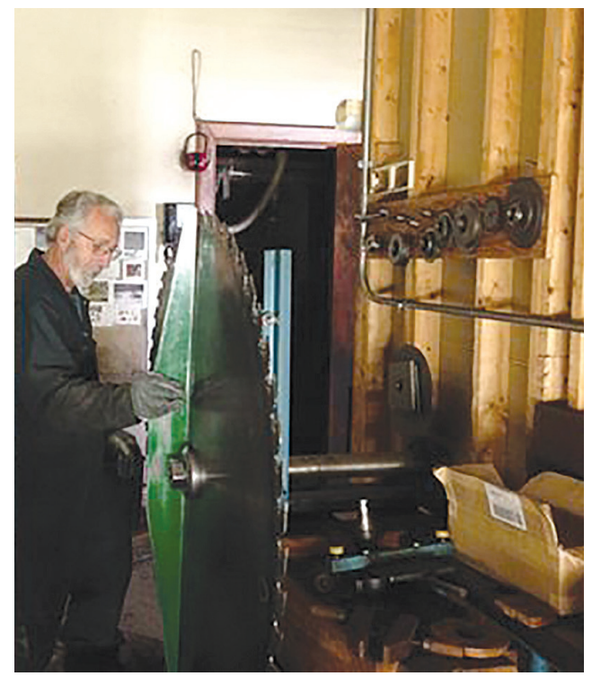
A sawmaker's straightedge is a precision tool.

So, it follows that if the saw doesn't meet all of those conditions at the same time, it needs to be hammered. If you own a real 48" saw maker's straight edge, you can easily check to see if the saw is still flat on the logs side or not. No a 48" carpenter's level won't do unless the saw is bent so far that you almost don't even need a straight edge to see it.